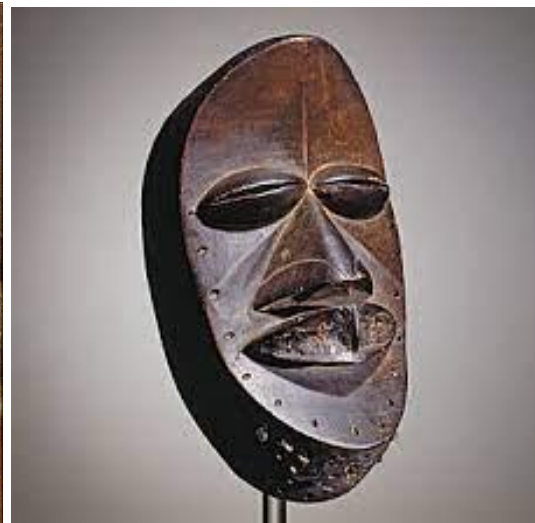
Mask, Ivory Coast